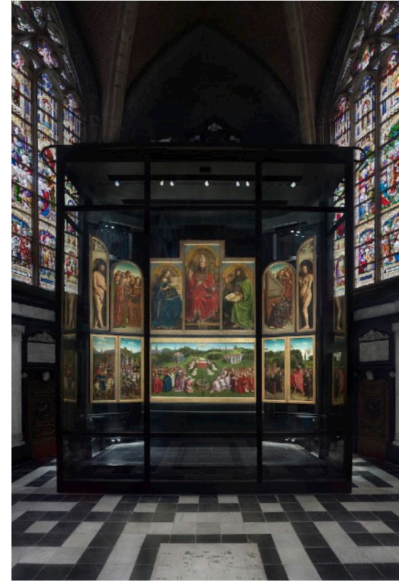
Above: The Ghent Altarpiece Right: Altar of the Kings (Altar de los Reyes)