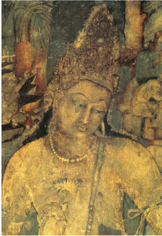
Above: Caves of Ajanta Right: Great Mosque of Damascus